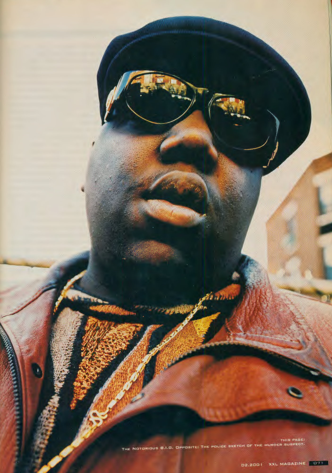
THIS PAGE: THE NOTORIOUS B.I.G. OPPOSITE: THE POLICE SKETCH OF THE MURDER SUSPECT.