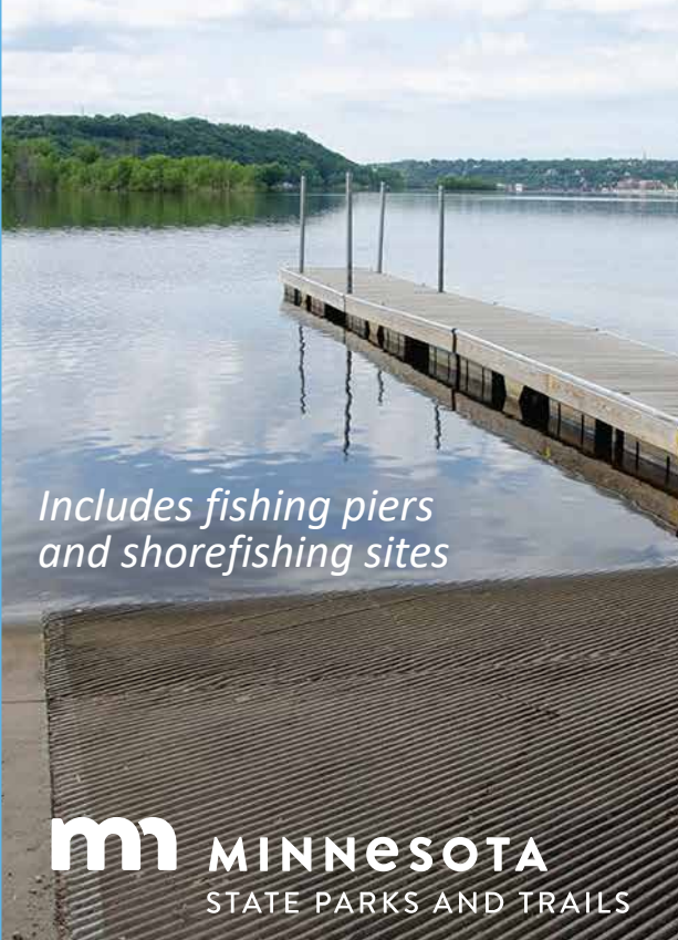
Includes fishing piers and shorefishing sites