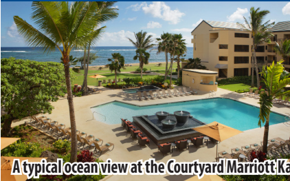
A typical ocean view at the Courtyard Marriott Kauai

Enjoy stunning views of the Pacific Ocean at all three of our beachfront hotels by pre-booking our optional Kings View room upgrade package.