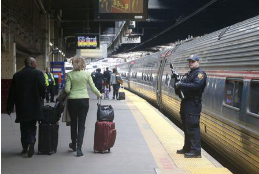
People board the annual N.J. Chamber of Commerce train ride to Washington in Newark in 2018.

"Were there men on there who saw the corridor as a runway with women walking up and down as they were making comments? Yes," she said. "I was shocked."