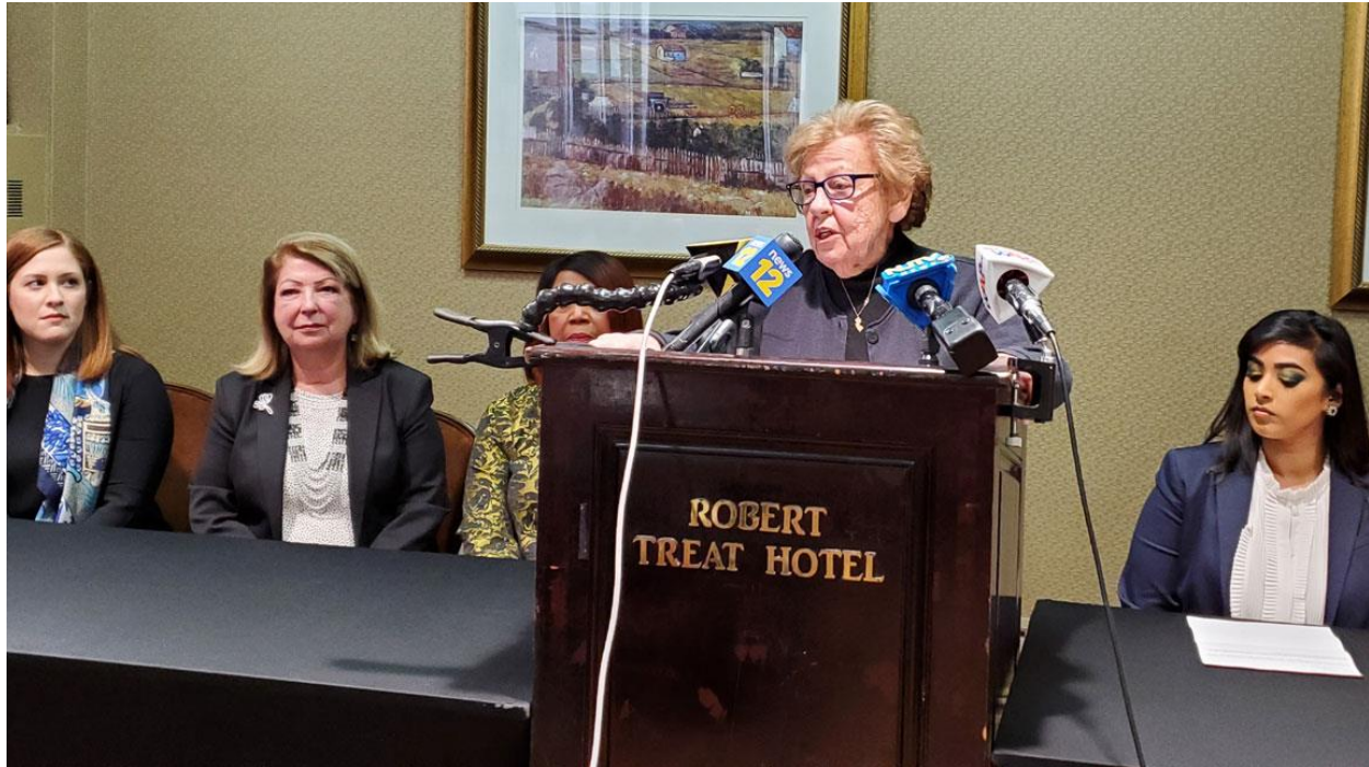
NEW JERSEY SPOTLIGHT