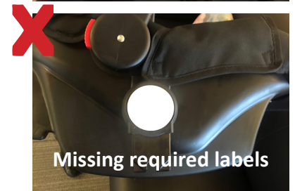
Missing required labels