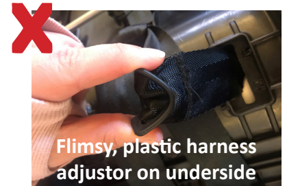
Flimsy, plastic harness adjuster on underside