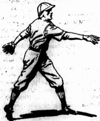
Two Fast Lake County Teams