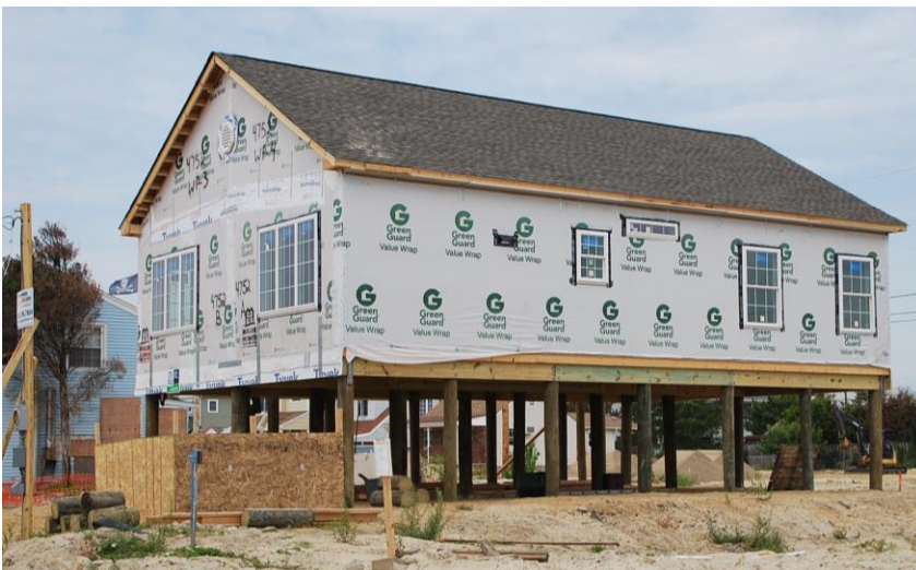
The new “look” of Ortley Beach, as people begin to raise their homes.