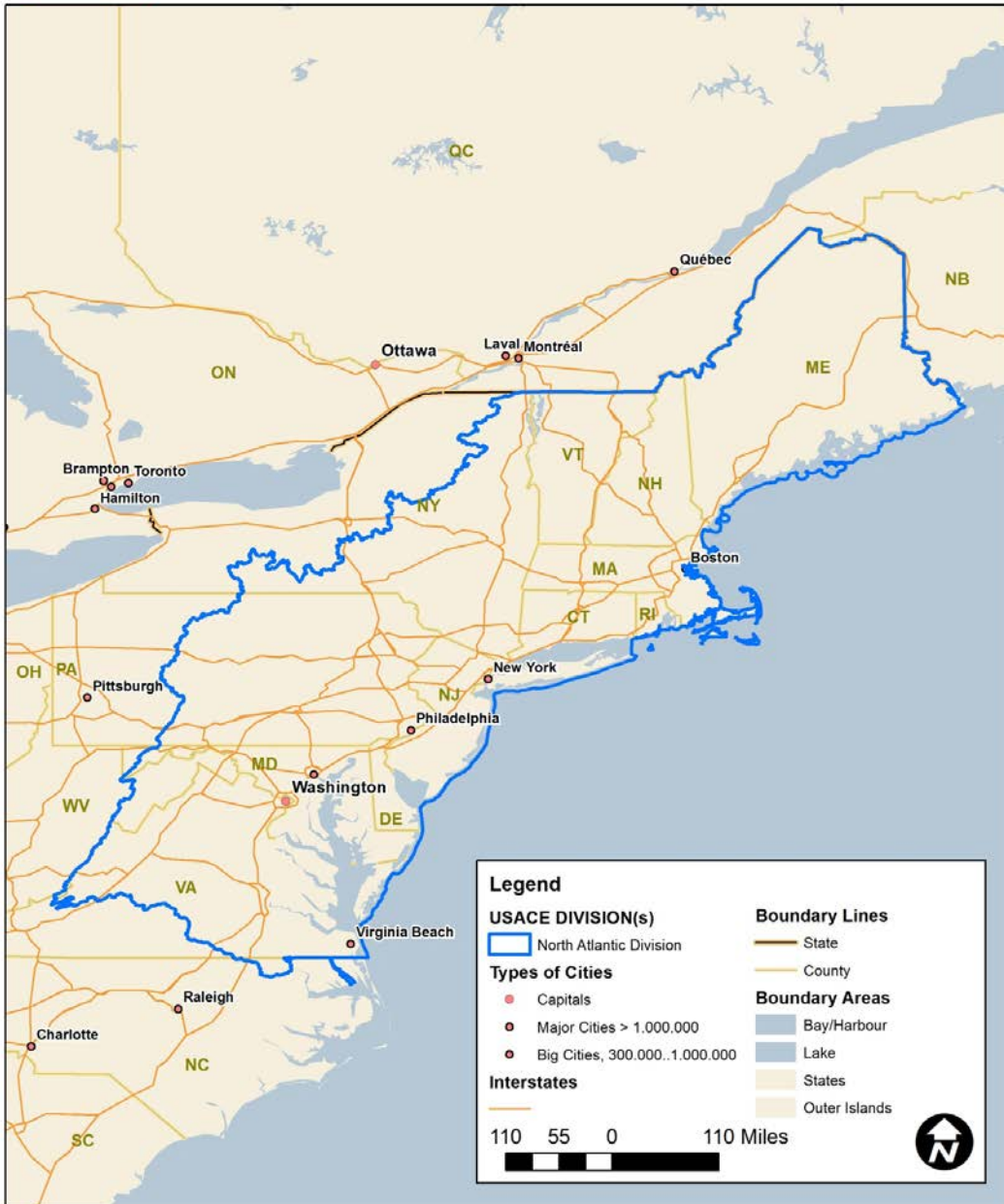
Figure 1. North Atlantic Division boundaries